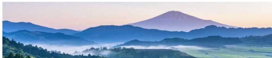
Mt. Fuji World Cultural Heritage Site