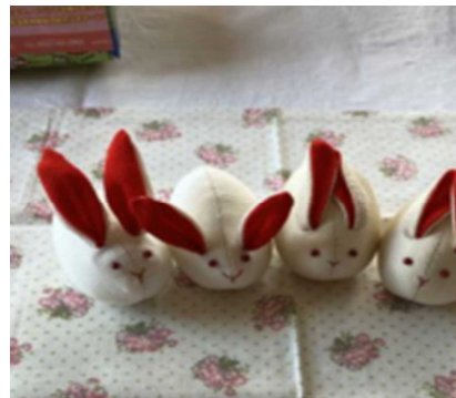
Hands-on Tsurushi Bina Decoration Experience