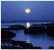
Matsushima Bay, Miyagi Prefecture

The club has 41 bays from 25 different countries (as of March, 2018).