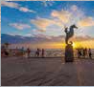
Bay of Banderas, Mexico