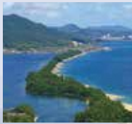
Miyazu Bay/Ine Bay, Kyoto Prefecture