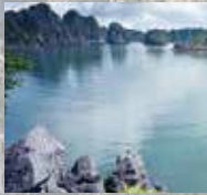
Halong Bay, Vietnam