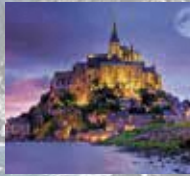
Mont Saint Michel, France