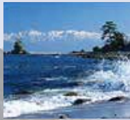
Toyama Bay, Toyama Prefecture