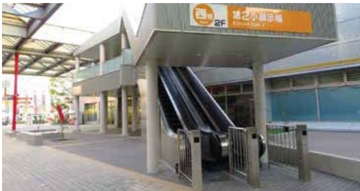
An escalator of a West Building newly built in April 2019