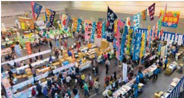
South Building Exhibit Hall- Industry Festival Shizuoka 2018