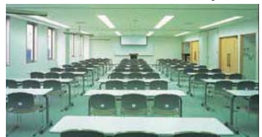
Central Building Meeting Room 401~403