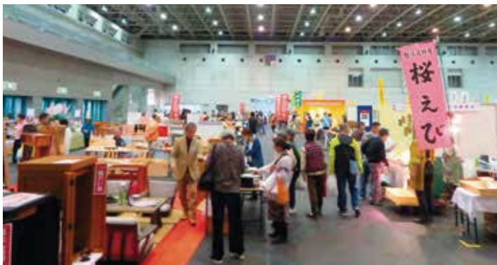
North Building Exhibit Hall- Industry Festival Shizuoka 2018