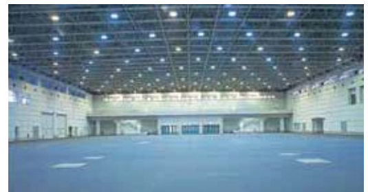
North Building Exhibit Hall