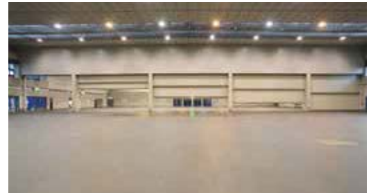
South Building Exhibit Hall