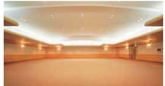
North Building Reception Hall