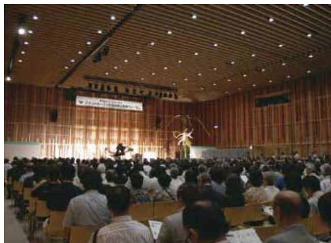
Convention Hall A