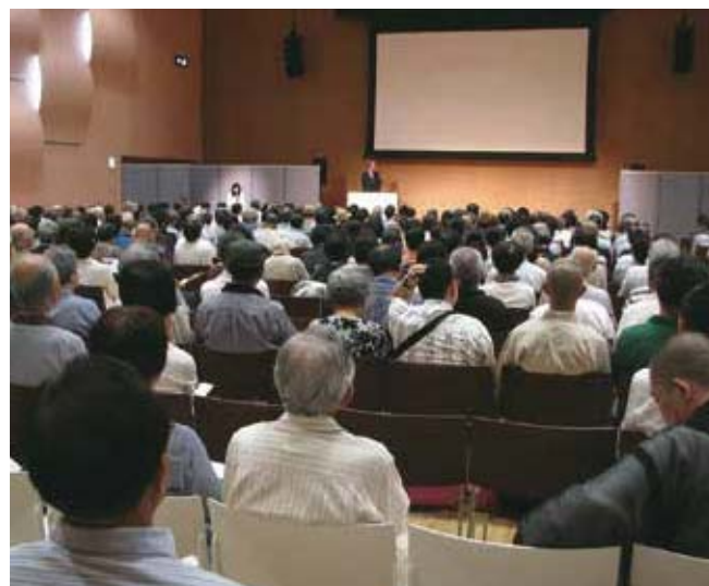
Convention Hall B